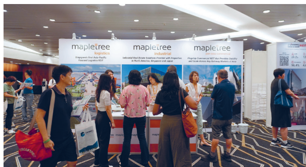
Engagement with retail investors at Singapore REITs Symposium 2024.

To subscribe to the latest news on MIT, please visit www.mapletreeindustrialtrust.com .