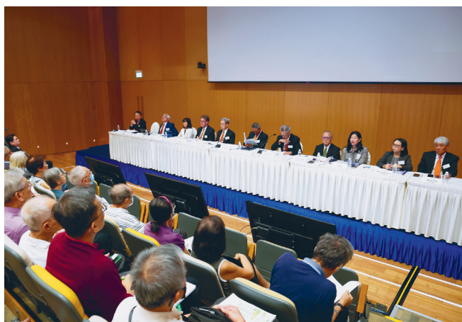
Engagement with Unitholders at MIT's 14 th Annual General Meeting.

MIT's Investor Relations Policy outlines the principles and practices in guiding the communication with its Unitholders and the investment community, which is published on MIT's website.