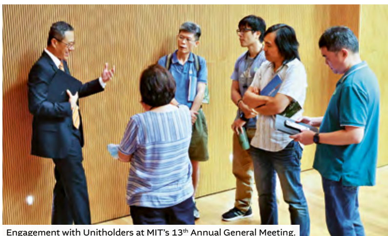
Engagement with Unitholders at MIT's 13 th Annual General Meeting.