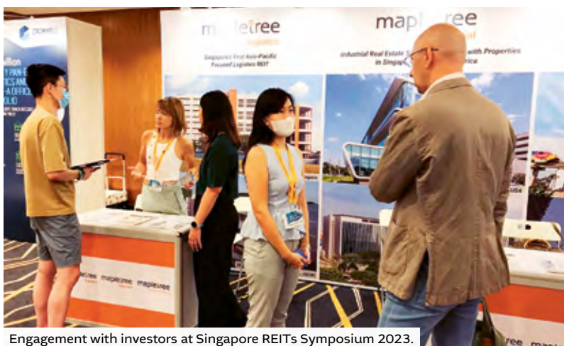
Engagement with investors at Singapore REITs Symposium 2023.